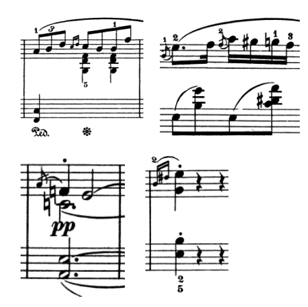
Ex. 8: Ornamentation in Folk-song , Album Leaf , Waltz and Fairy Dances , respectively.