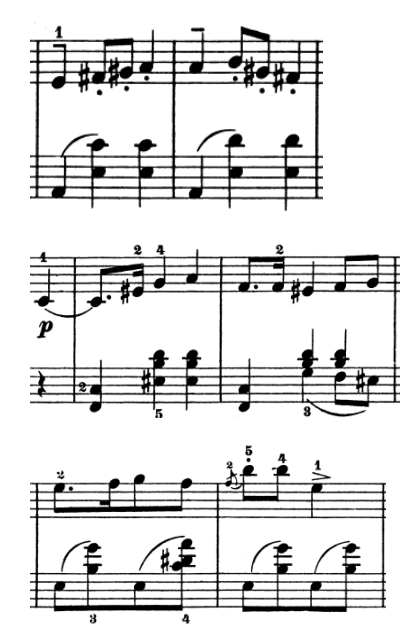
Ex. 5: Left hand jumps in Waltz, Folk-song and Album Leaf , respectively.

The way in which one approaches the keys is vital to tone production and continues to confront students in their development of primary piano techniques. From varied articulation such as staccato, legato, and tenuto, to arm weight, the concept and production of touch is vast. For intermediate students, some types of touch like staccato and legato, in a rudimentary sense, have been mastered. Although these types of touch can be further cultivated, Grieg's Lyric Pieces, Op. 12 allow for a deeper exploration of touch beyond basic articulation. One challenge that students face is hand movement, which requires preparatory gestures and advanced planning to execute. When approaching Waltz, students must be able to aim their left hand jumps to accurately play the correct notes (ex 5). In addition, the approach to the key must be kept in mind as the jump may cause students to accent the second beat of the measure. One way that teachers may train a student's ear to become more aware is by playing the beginning measures of the left hand in several different ways and having the student identify the correct approach. These same technical requirements are seen in both Folk-song and Album Leaf, demonstrating the value of developing this technique (ex 5).